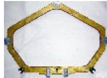
LHF-1090 Rib # 3