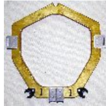
LHF-1070 Rib # 1