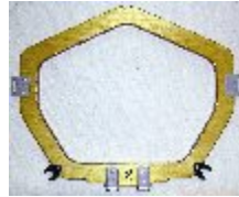
LHF-1080 Rib # 2