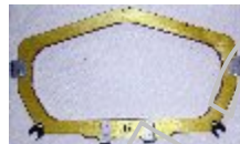
LHF-1110 Rib # 5