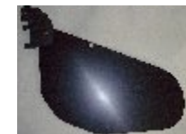
Rudder Pedal Assembly (MK1) Standard Rudder Blade w/ head